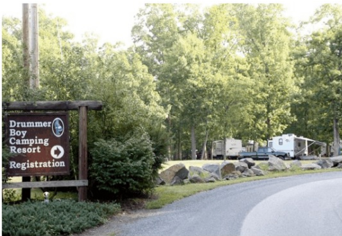
Drummer Boy Camping Resort